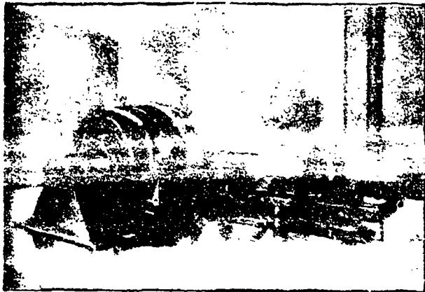
SIDE CRANK IDEAL DIRECT CONNECTED TO GENERATOR.