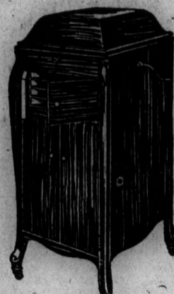
Victor-Victrola XI, 8 Mahogany or oak