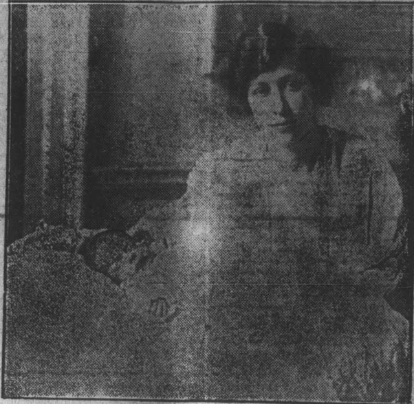
Princess Mary gave birth to her second child, a boy, at Goldsborough Hall, one of the seats of the Lascelles family, on August 21.

who were qualified to judge that there was nothing finer in Canada, and the committee is especially grateful to them for their kind assistance which was so much appreciated by the vast audience.