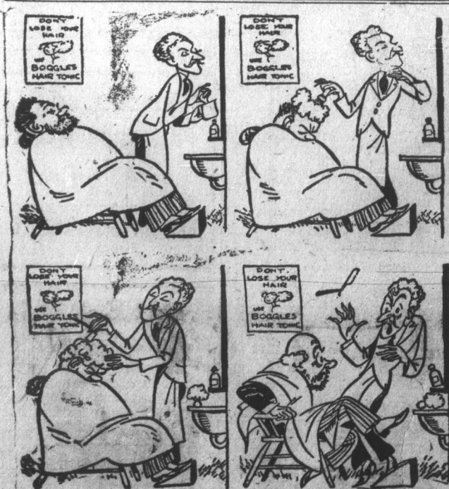
THE CUSTOMER WHO FELL ASLEEP —Passing Show.