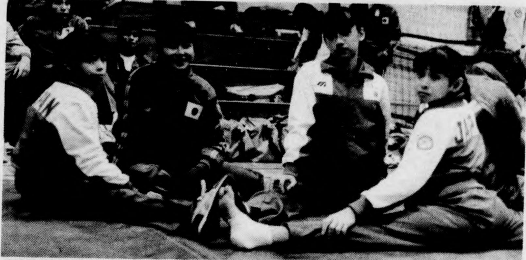
JUST HANGING OUT: Several members of the Japanese gymnastics delegation stretch out before Monday night's demonstration at the Tait gym.