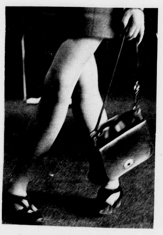
Is my portrait going to be in Excalibur?