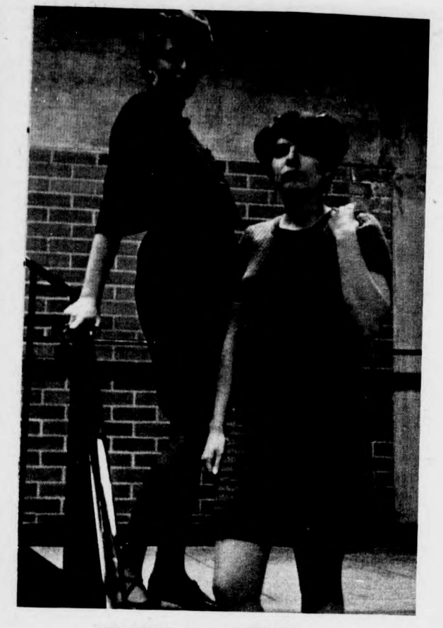
The Girls from AUNTIE