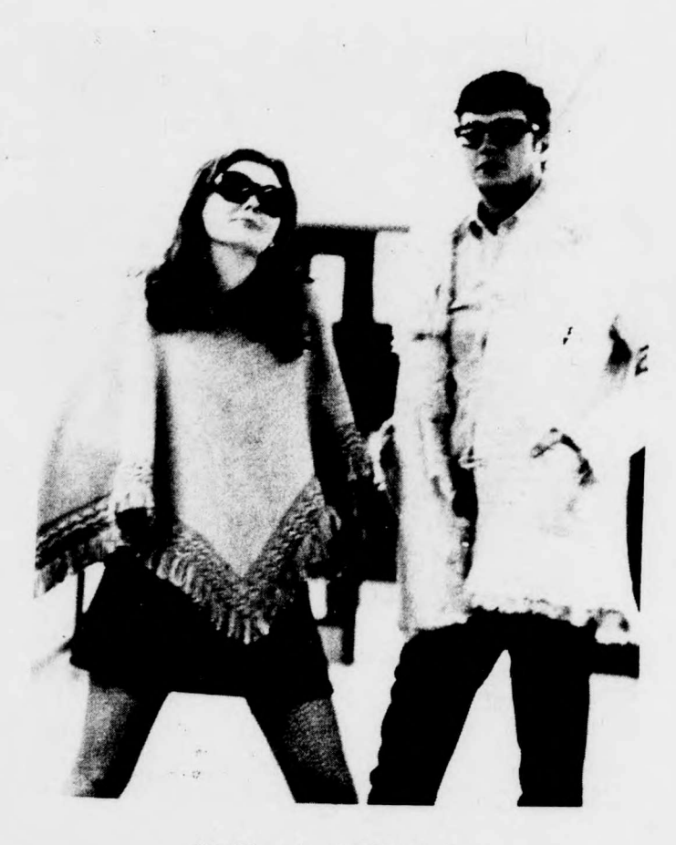
Oh Cisco!...oh, Poncho!...