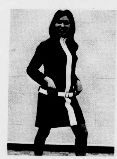
Oh you gypsy savage!

in hacked-up sweatshirts and grubby jeans, accessorized with fruit boots (the exception being those suave, debon-aire biz boys, of course). But the most prominent apparel of the men is hair--uncut haircuts, mous-taches, and vestiges of hair on chins that are reminiscent of our primate an-cestors.