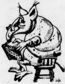
ARMIE The RIVERVIEW ARMS ARMADILLO