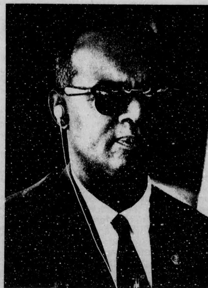
Dr. Eric Williams

Considered by many to be the Caribbean's godfather, Dr. Williams was educated at Queen's Royal College in Trinidad and at Oxford University where he graduated in 1935 First in the First Class in the B.A. examination and in 1938 with the Doctor of Philosophy degree. He served for many years as Professor of Political and Social Science at Howard University, Washington D.C. and with the Caribbean Commission. He is recognized as the authority on West Indian History and