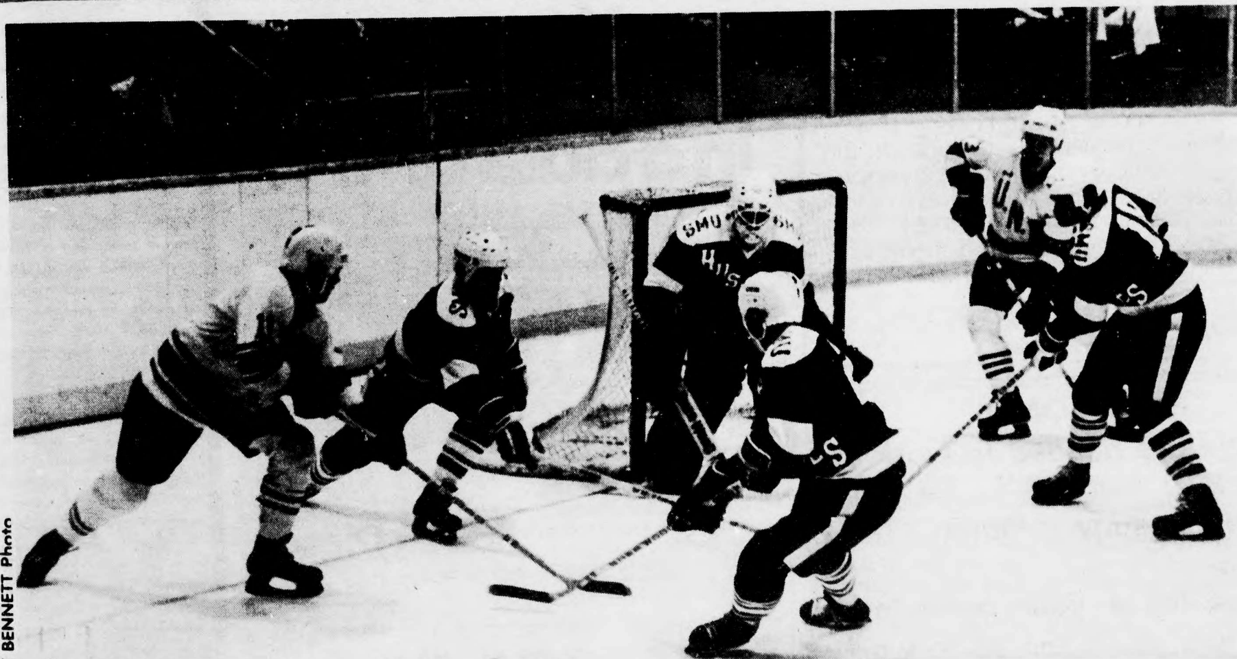
BEVERLEY BENNETT Photo

VOLUME 115, ISSUE 21/MARCH 6, 1981/24 PAGES/FREE