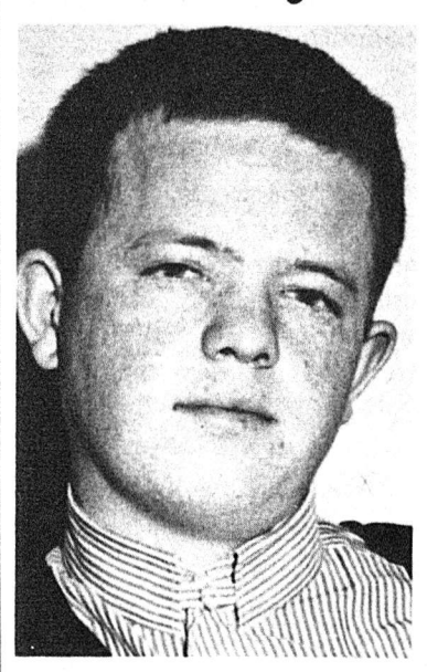
MILLER . . . easy as one. . .