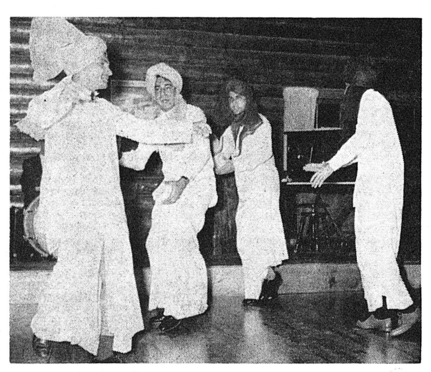
DANCE FROM THE PUNJAB (on an international topic)..