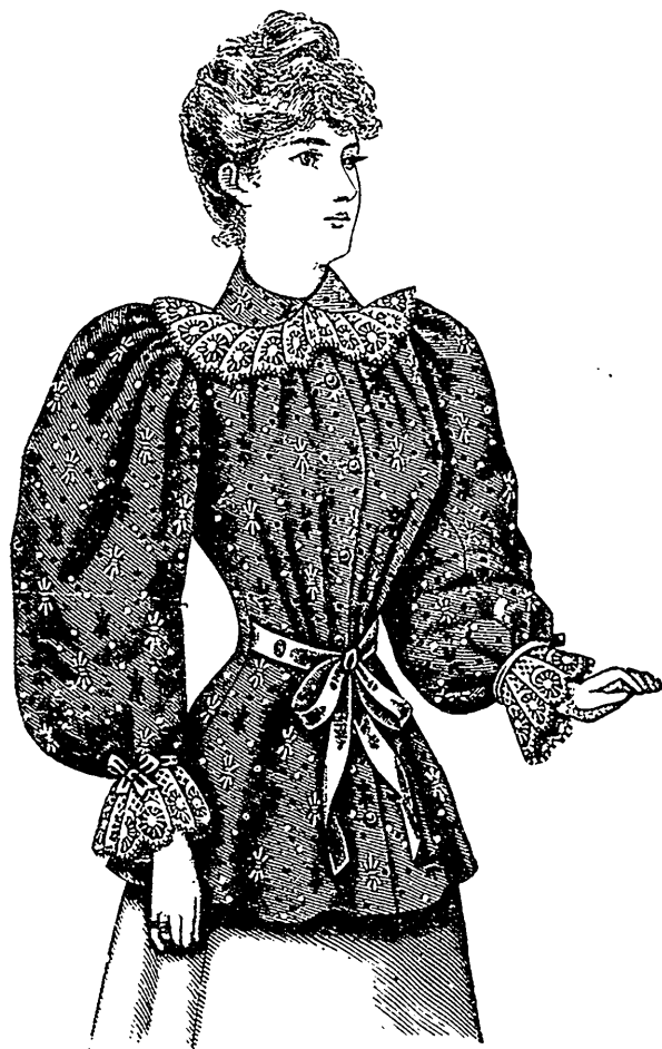
FIGURE NO. 513 D.—LADIES' DRESSING-SACK.—This illustrates Pattern No. 6581 (copyright), price 1s. or 25 cents. (For Description see Page 623.)

FIGURE NO. 508 D.—This consists of a Ladies' basque and skirt. The basque pattern, which is No. 6595 and costs 1s. 3d. or 30 cents,