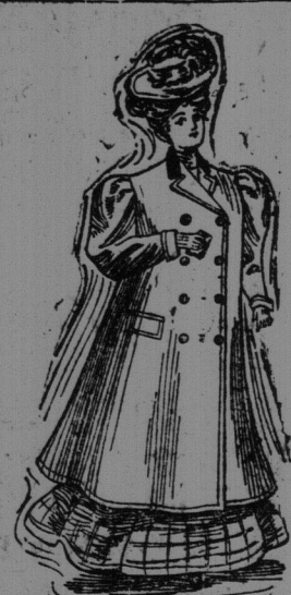
This very stylish tweed coat with velvet collar, priced $12.00.

ST. JOHN STAR, SATURDAY, OCTOBER 27, 1906