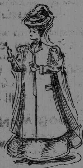
This coat is made from plain Korean cloth in black, navy and two shades of fawn. $13.50.

We show this season the Best Assortment of Ladies' Ready-to-Wear Coats that we have ever gathered together, and every Garment is priced with a view to keeping up the reputation of this store as having the Best Garments at the Lowest Prices that can be found anywhere.