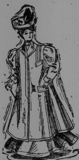
This Berlin made garment, very fine tweed, attractive patterns at $8.70 and $10.50.