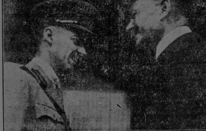
His Excellency was snapped while having a chat with a war veteran.