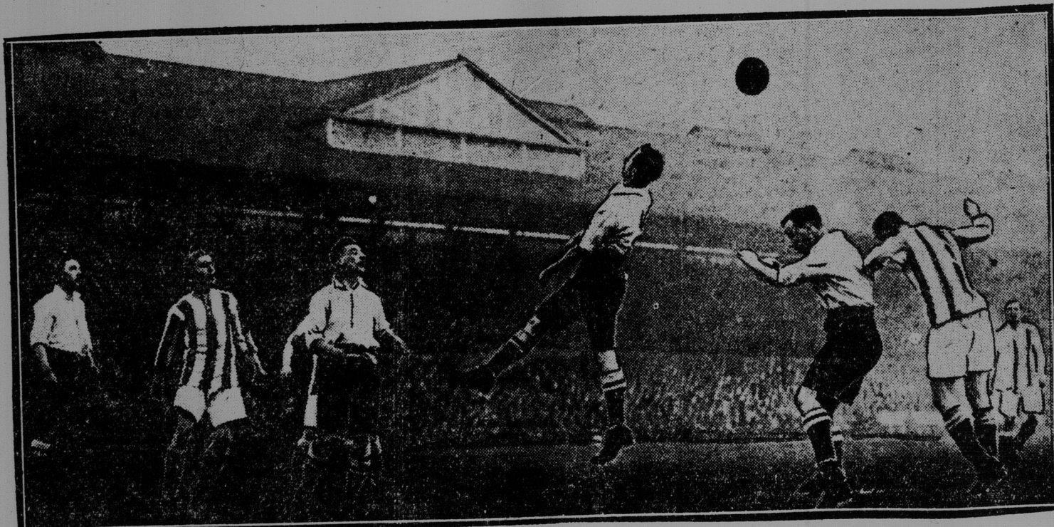
An unusual snapshot of an exciting moment in the second cup tie game between Corinthians (in white shirts) and Brighton and Hove. It was found necessary to play three games and Corinthians were finally beaten.