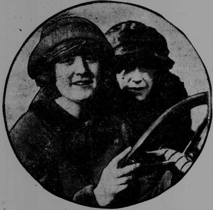
The Marchioness of Queensberry photographed with her mother just after completing a 12,000 mile drive from Boulogne to Rome.