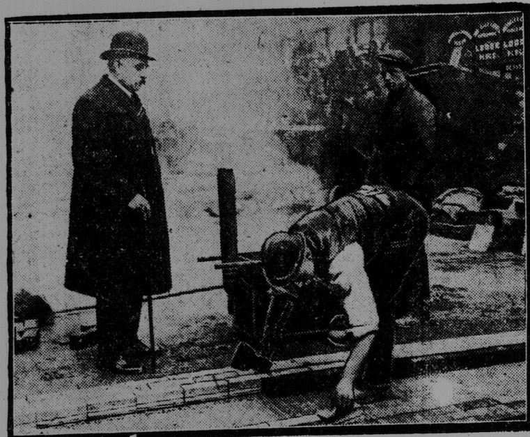
Trying a new experiment in Holborn, England, where a street is being paved with rubber "bricks."