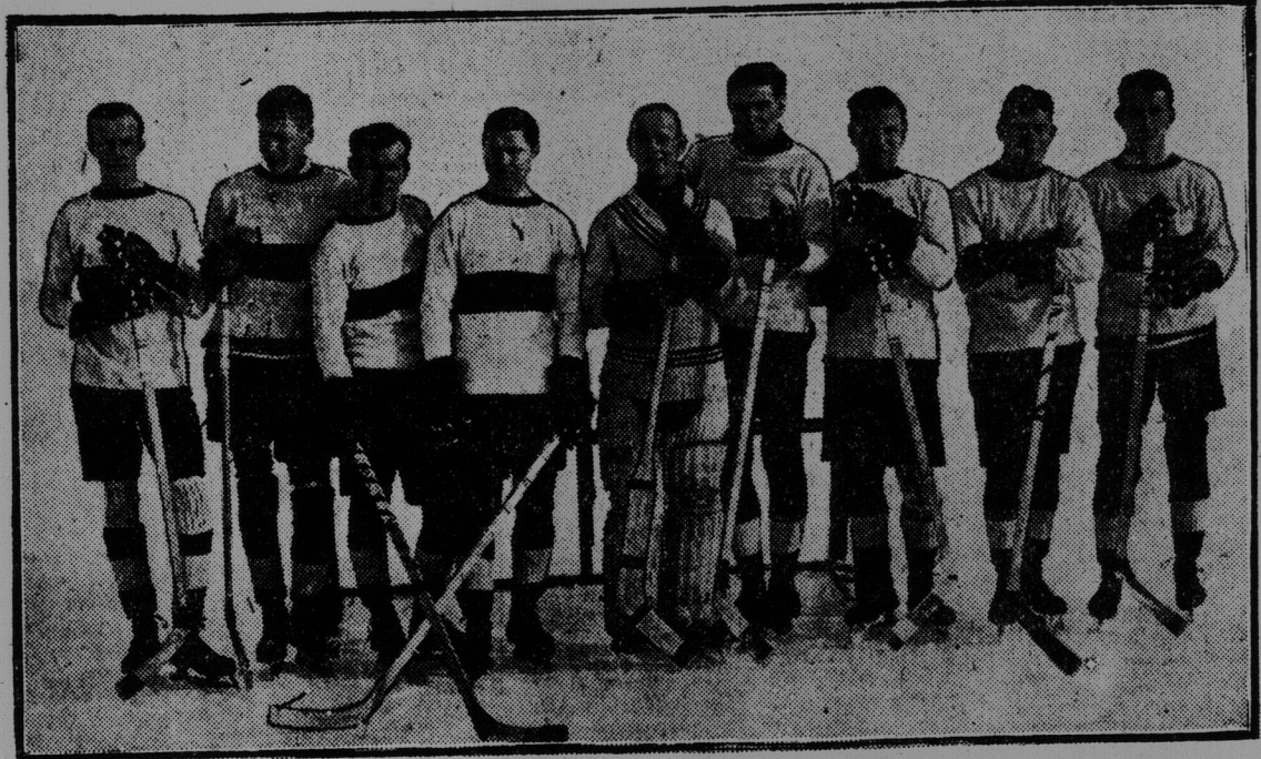
The Oxford hockey team which has just returned undefeated from a tour of Europe. It is composed largely of Canadians, including graduates of Toronto University.