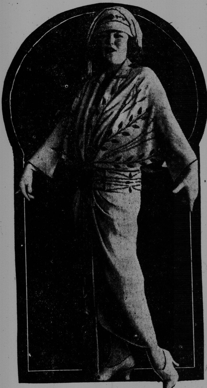
A street costume of Egyptian design. The stone ornaments used in the embroidery are reproductions of specimens recently removed from the tomb of Tutankhamen.