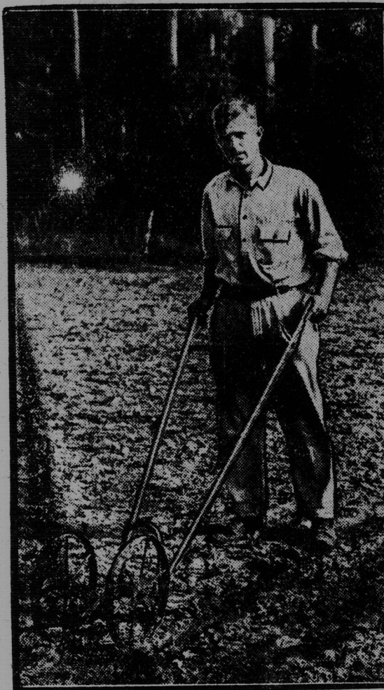
Fred Merkle, famous baseball player, spends the winter cultivating grape fruit.