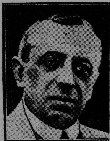
Fritz Thyssen, one of the German coal operators in the Ruhr, who was tried for conspiracy by the French and fined.