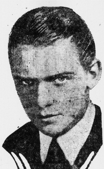
DOUGLAS FAIRBANKS, JR.

He is now being treated like any other motion picture player of promise, with-out any effort to capitalize his father's name.