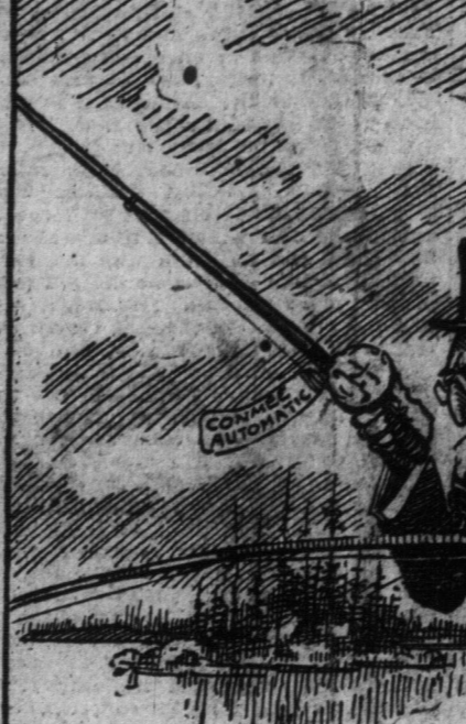
GUIDE GRAHAM: Take care, boss, you're pullin' the anchor up.

OTTAWA, April 20.—(Special.)—The "sawdust wharf" at Richibucto formed the subject of debate on the motion to go into supply on public works estimates this evening.