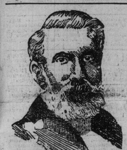
Sir John Voce Moore. The New Lord Mayor of London.

nto Stock Exchange.) stocks on London, New and Toronto Stock ExStocks Bought and Sold 136 TEMPLE, the car representing the English-speaking race. The latter displayed among other and Financial Agent things Britannia and Columbia seated be-& COMPANY