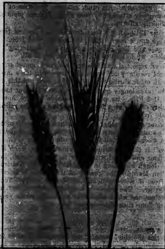
MARQUIS KUBANKA CLUB (DURUM)

During the years 1898 and 1900 Carleton of the Bureau of Plant Industry of the United States Department of Agriculture, brought several varieties of this type of wheat from its south Russian home to