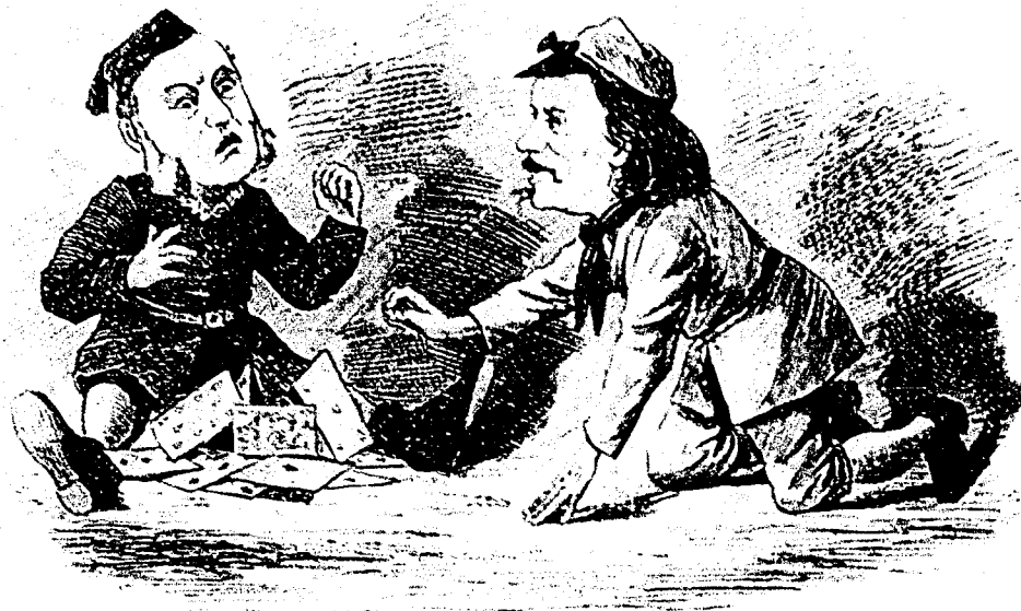
CASTLES IN THE AIR. How the naughty Adolph blew down the card house of little Alexander.