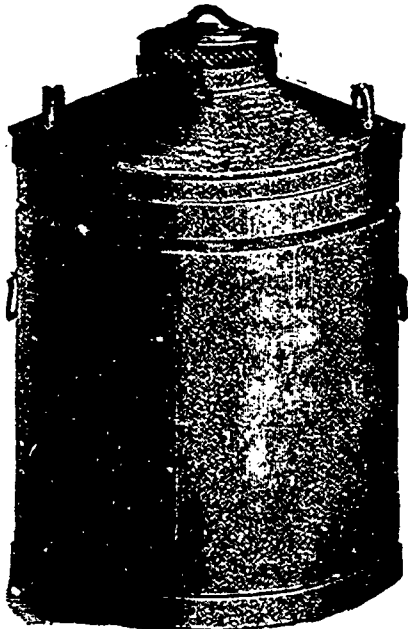
"EMPIRE STATE" MILK CAN.