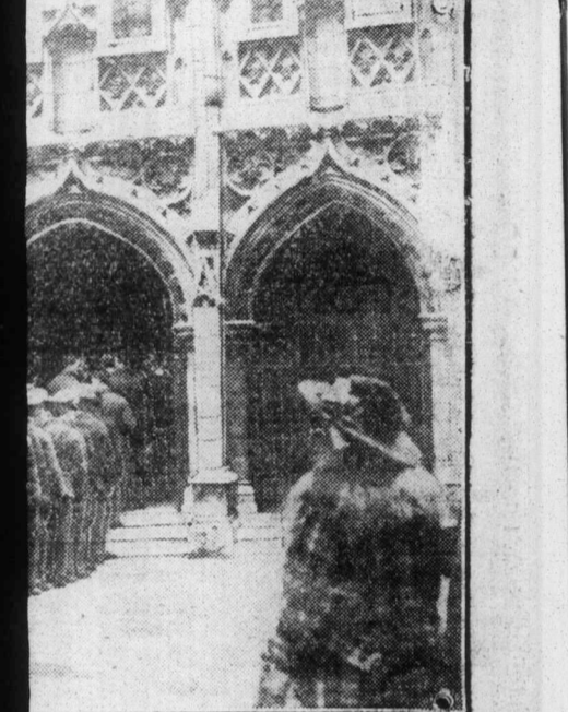
Photo shows some of the Canadian street on Sunday morning, where special services are being held.

Cook's Cotton Root Compound. A safe, reliable, and effective medicine. Sold in three degrees of strength—No. 1, $1.00; No. 2, $0.75; No. 3, $0.50 per box. Sold by all druggists or sent prepaid on receipt of price. Free pamphlet. Address: THE COOK MEDICINE CO., TORONTO, ONT. (Formerly Windsor).