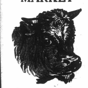
Dealer in Meats, Groceries. Provisions, Vegetables, Fruits, Etc.