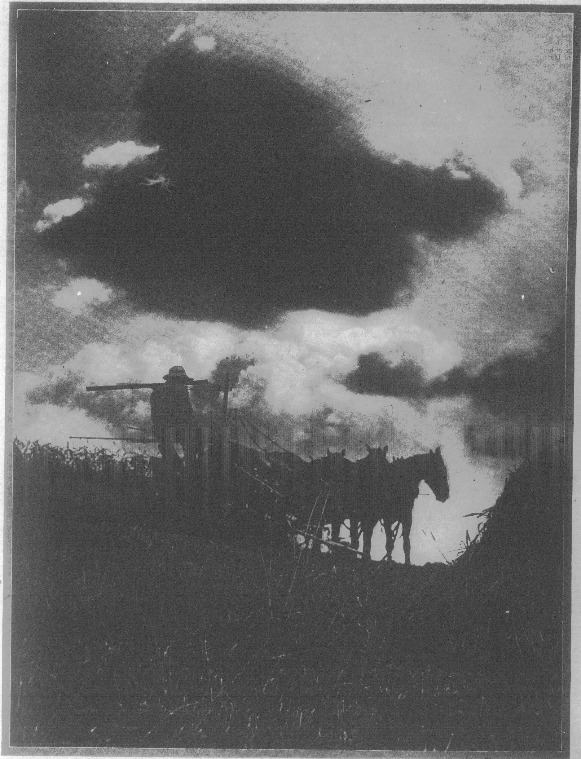
The Beginning of Harvest.

Baie de Vin and orning we made a of the Vin River spined Sculpins, Eel, and a large is a very common pearance, as may d the long spines the deep. It is gest of scientific us, a name es to be "taken to " and "cottus," and the second Of the Stickle- n our haul three onest being the 2. The Stickle- water and they breeding habits. globular hollow ts, built in the the female has le stands guard great ferocity, ly set. reds of salmon- g out from the tside the islands in drifting for ng of a gill-net, to any stakes, at is made fast for some hours. and some idea i Bay may be lay the steamer y of the points salmon. And ught that day, ht miles up the m are collected ately has been ounds.