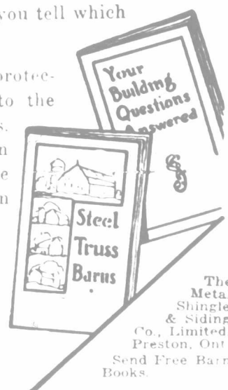
The Metal Shingle & Siding Co., Limited, Preston, Ont. Send Free Barn Books.

The Metal Shingle & Siding Co., Limited, Preston, Ontario