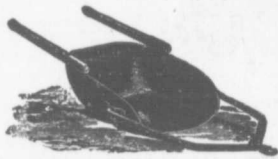
PRESSED BOWL DRAG SCRAPER

KINSTON, ONT.—Metal ceiling in the British North American Bank: J. Nugent & Co., successful tenderers.