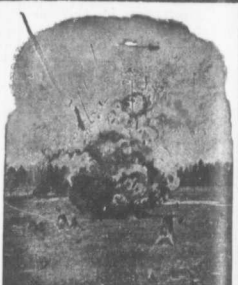
What happened to the Stump by using Stumping Powder.