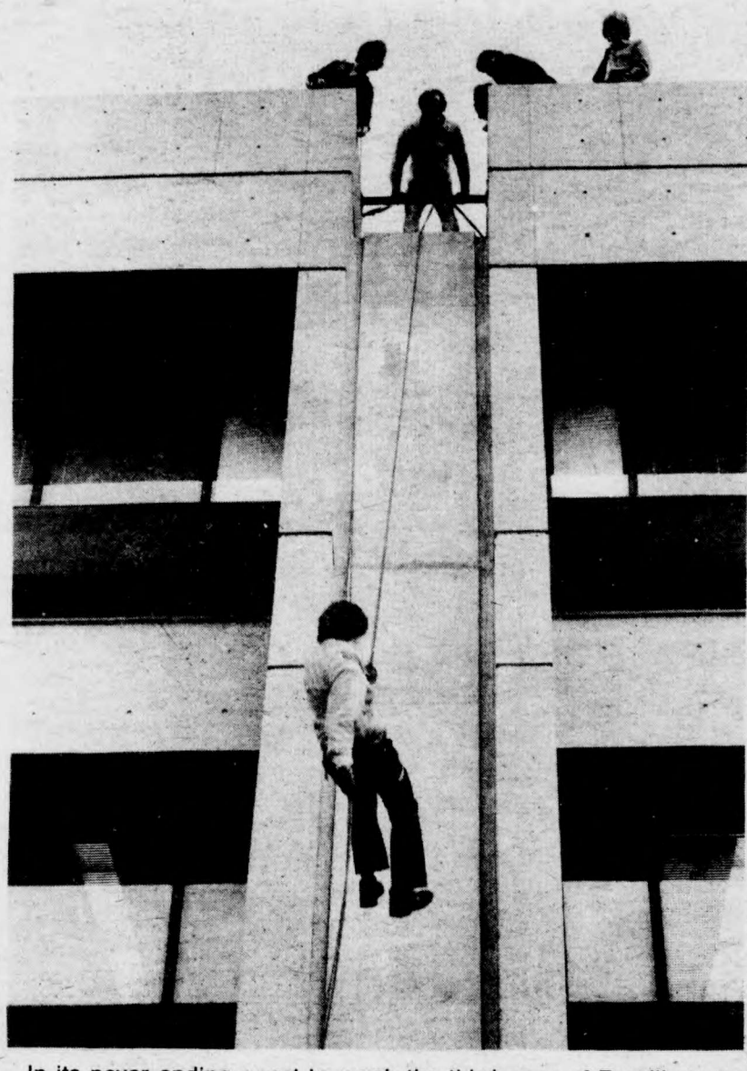
In its never-ending quest to reach the third page of Excalibur, the York Outdoors Club last week launched its second annual rappel down the west side of the Petrie Science Building. The ruse worked.

Following the meeting a collection was taken and $70 was raised.