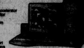
May not be exactly as shown, picture includes some options

285 Restigouche Rd Limited Quantities Available