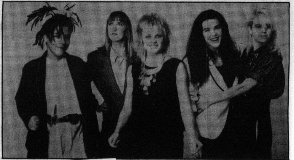
Bolero Lava you make me very happy

In a word, Why? Why was this 'music' made? Why was it marketed? Why, why, why? This question may be answered when the Meaning of Life is discovered.