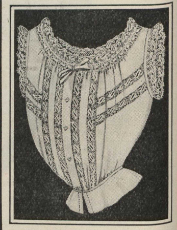
R1-3507. Women's Corset Cover, made of extra fine Cotton, low round neck finished with one row lace insertion, beading, silk ribbon draw, narrow edge of fine lace, arms to match, front with handsome design of four rows fine lace insertion running down from neck to waist, two rows across front. full front, pearl buttons: sizes 32 736 to 42, extra special. Sale Price

Every page in this Catalogue offers big savings