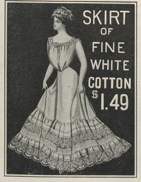
R1-2506. Women's Skirt, made of extra fine Cotton, French band, six inch flounce of fine Lawn, trimmed with two clusters of three narrow tucks, one rowextra fine heavy Cluny insertion 4 ins. wide, finished below with Lawn ruffle 5½ ins., finished with cluster of five tucks, and three narrow tucks with four ¾ inch tucks between, 4½ in, ruffle of extra fine Cluny lace, this makes a very hand someskirt, generous width, well made in every particular; lengths, 38, 40 and 42 inches, extra 1.49 special. Sale price