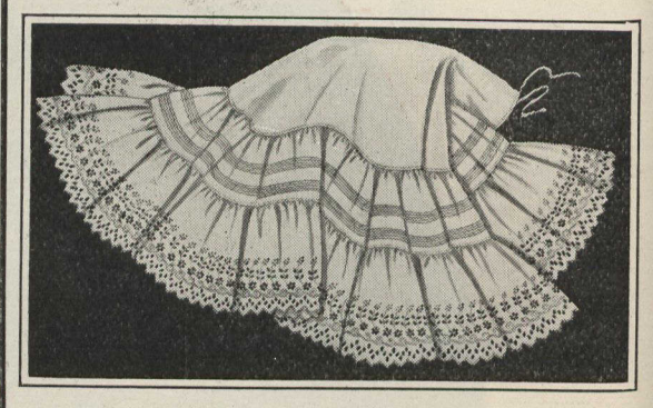
R1-2505. Women's Skirt, made of fine Cotton, French band, eight inch flounce of fine Lawn, trimmed with two clusters of five narrow tucks, finished below with 12 inch flounce of extra fine skirting embroidery, under dust ruffle, good width, well made in every way; lengths 38, 40 and 42 inches, special value. Sale Price .... 1.23