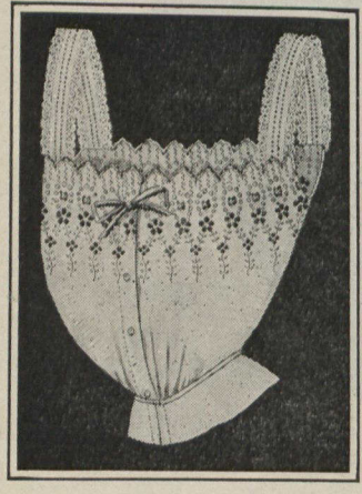
R1-3503. Women's Corset Cover, Empire style in all-over embroidery, new patterns in well worked embroidery, ribbon draw, straps of hemstitched lawn with lace edge over shoulders, pearl buttons; sizes 32 to 42 inches, special value. 390