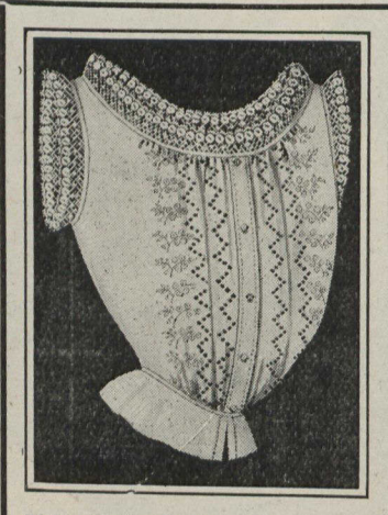
R1-3504. Women's Corset Cover, front made of all-over embroidery, Nainsook back trimmed with three clusters of narrow tucks, low round neck trimmed with fine lace edge, arms to match, pearl buttons; sizes 32 to 42 inches, special value. Sale Price.....476