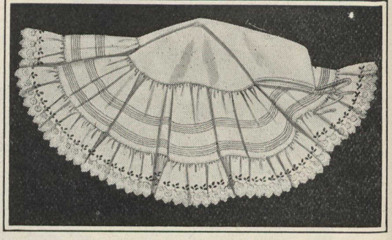
R1-2502. Women's Skirt, made of fine Cotton, deep flounce of Lawn trimmed with two clusters of five tucks and wide ruffle of skirting embroidery, neat patterns, well made and finished in every particular, generous width; lengths 38, 40 and 42 inches, special value. Sale Price..... 75C