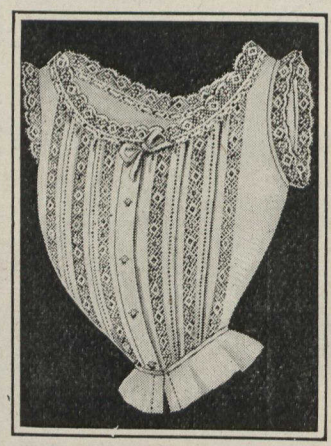
R1-3506, Women's Corset Cover, made of fine imported Cotton, low round neck finished with lace edge, beading and silk ribbon draw, arms to match. handsome full front style, with six rows of fine lace insertion, four rows of lawn with hemstitched tucks, back with three rows of lace insertion, two rows of lawn with hemstitched tucks, pearl buttons; sizes 32 to 42 inches. extra special value. Sale Price 596