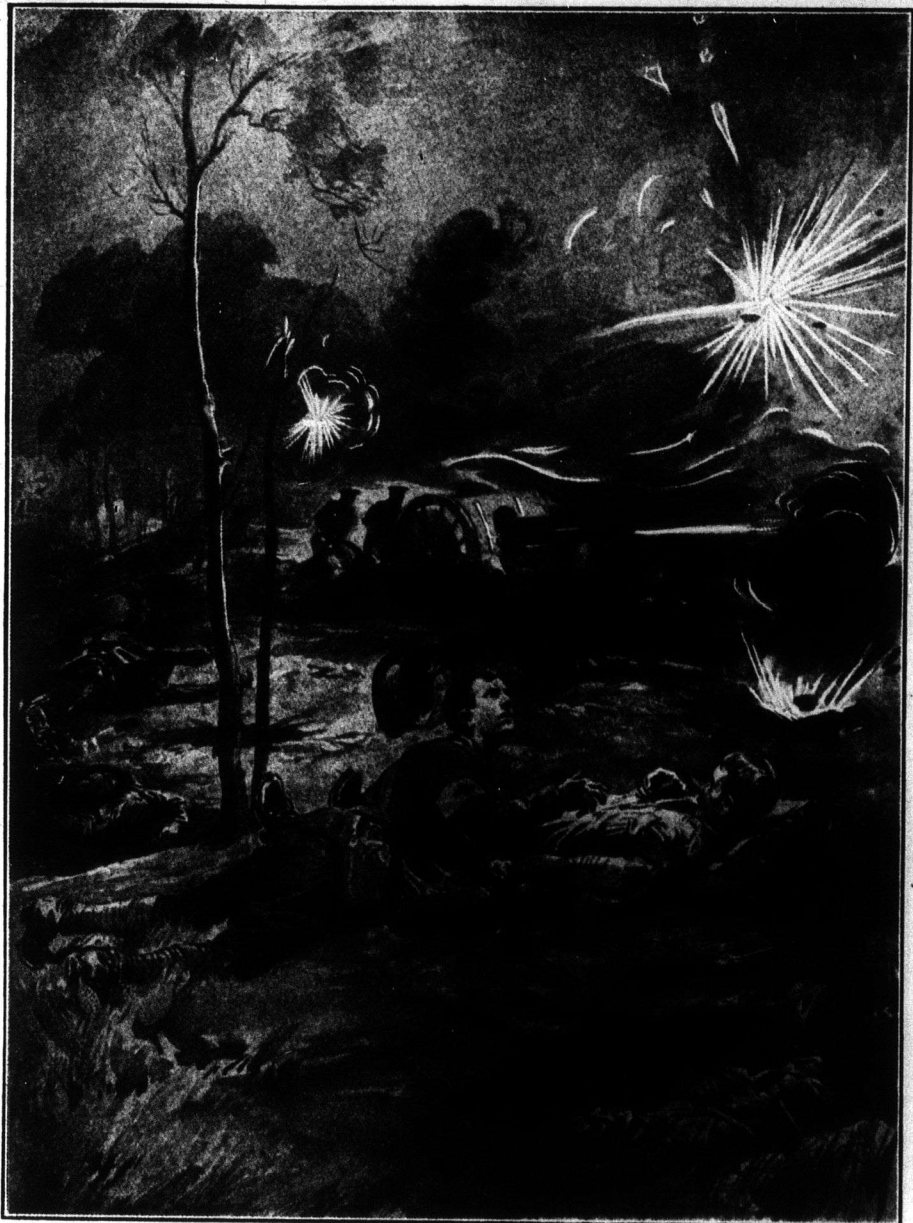
An orderly in the Royal Army Medical corps went out to attend to a badly wounded officer. While he was applying bandages a shot hit him and he knew he was mortally wounded. Nevertheless he calmly went on with his work, saving the officer's life, and had barely finished it ere he fell dead.