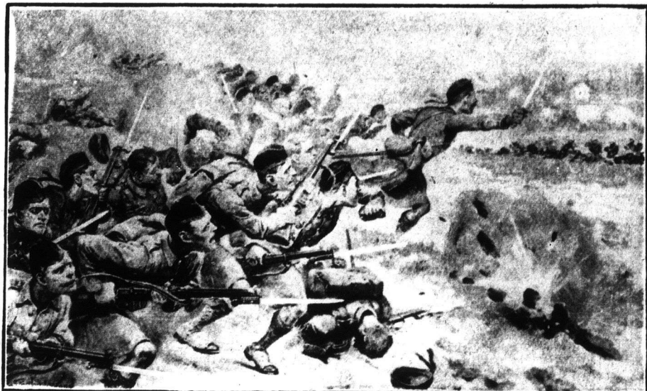
The gallant charge of the London Scottish