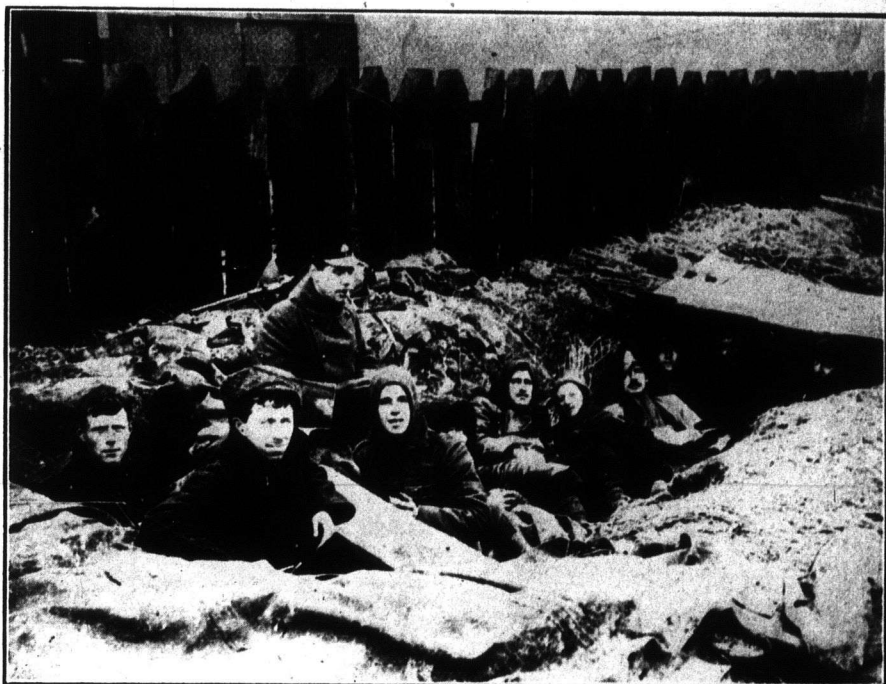
Belgian and British cavalry wintering in the trenches.