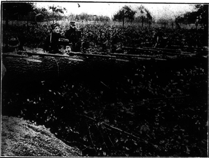
Belgian Soldiers. In front of the tree trunk a pit has been dug and covered with branches.

The three Scandinavian kings accompanied by their ministers of foreign affairs and secretaries met Dec. 18th and 19th at Malmö, southern Sweden, to discuss affairs of common interest which have arisen as a result of the war. The meeting was arranged by King Gustav (left), who invited King Frederick of Denmark (center) and King Haakon of Norway (right) to visit him at Malmö. This meeting may be the most momentous one since war broke out as it may result in an alliance of the three Scandinavian kingdoms in a new triple alliance or triple entente. If such be the case then a new and powerful alliance of European nations will have been born. It is altogether unlikely that the Germans or Allies would attempt to attack any one of these Scandinavian countries when it is understood that they are united for defensive purposes against any such possible attack. It is understood, should an alliance of the three nations take place, it would be in the form of an alliance for defence only, no aggressive alliance being contemplated.