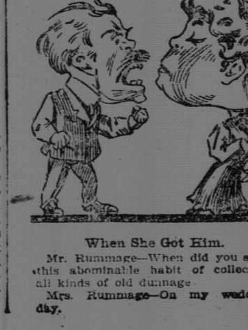
When She Got Him. Mr. Runnige--When did you start your remarkable habit of collecting fish? Mrs. Runnige--On my wedding day.

Why, the Idea. Hey there, you lazy loafer! Get up on this bed and drive. Do you think I am going to pay you to let me drive you around?