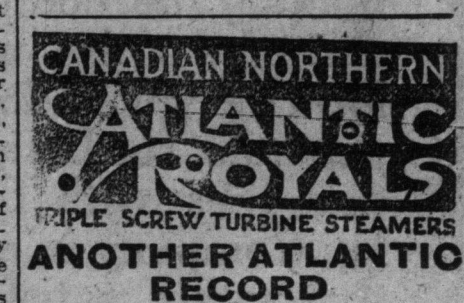
Table d'hote meals. Breakfast 75c, Luncheon 75c, Dinner $1.00. For tickets, reservation of berths and all further information, apply Intercol-onial Ticket Office, 51 King East (King Edward Hotel Block).

The "Royal Edward" has beaten all competitive records by 6 hours 25 minutes, completing the voyage from Bristol to Quebec in