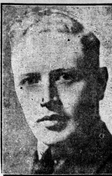
MAJOR RAYMOND COLLINSHAW, the famous Canadian aviator, who last June took a squadron to Russia, landed on Wednesday in England with the remainder of his comrades.

HAMILTON, April 23.—The local branch of the Independent Labor party passed a resolution tonight in opposition to the proposed referendum on the importation of liquor. The mover of the resolution suggested that Hon. Walter R. Rollo, minister of labor, who was present, be heard on the question. But the majority of the members present decided that there should be no discussion on it.