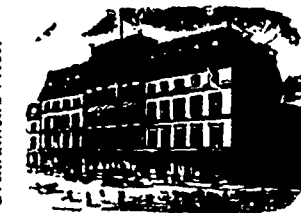
77 LAWRENCE HALL

First-class in every Respect! Appointments Perfect. Graduated Prices.