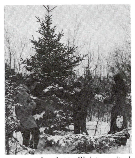
...is a happy Christmas ritual.

For ease and speed of handling, protection against breakage, and particularly for space-saving in transit, growers usually compress their trees by some type of baling operation before shipping them any distance. Hand-tied, multi-tree bales may be used, but individual trees may also be machine-tied with twine or machine-wrapped in a plastic net stocking.