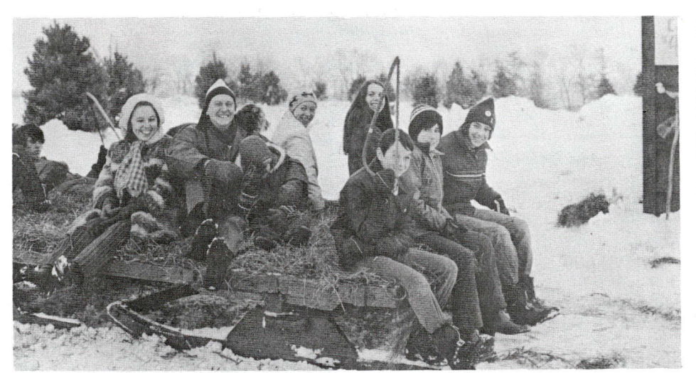
For many city folk a visit to a choose-and-cut operation...

greens or blue-greens that are in demand. Such problems leave something to the ingenuity and inventiveness of the grower as witness the action of some Scots-pine producers in spraypainting their trees to achieve the desired shade of green.