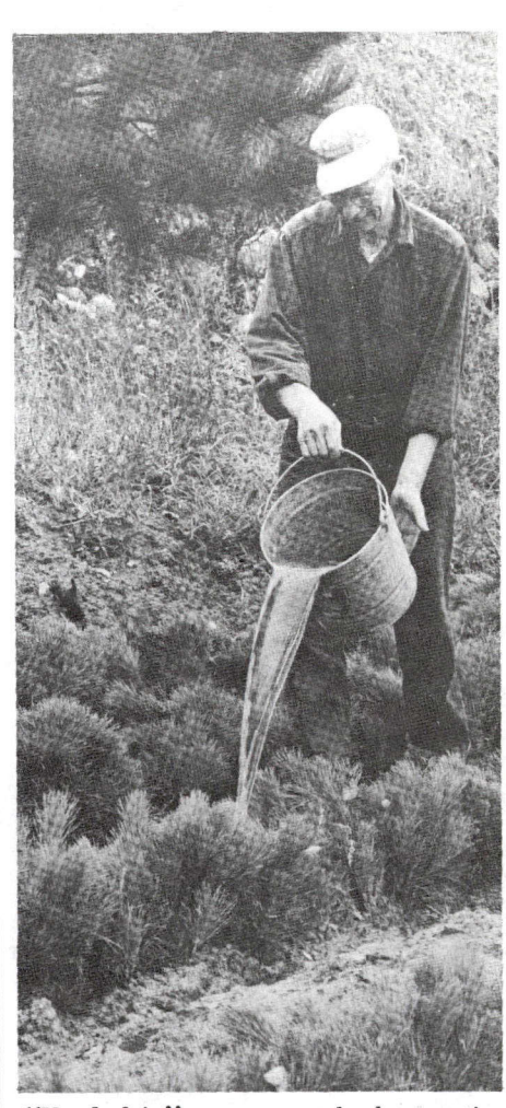
"Heeled-in" trees must be kept moist pending final planting.