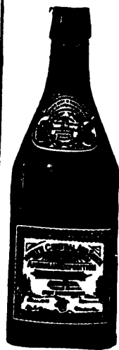
FAC-SIMILE OF WHITE LABEL ALE