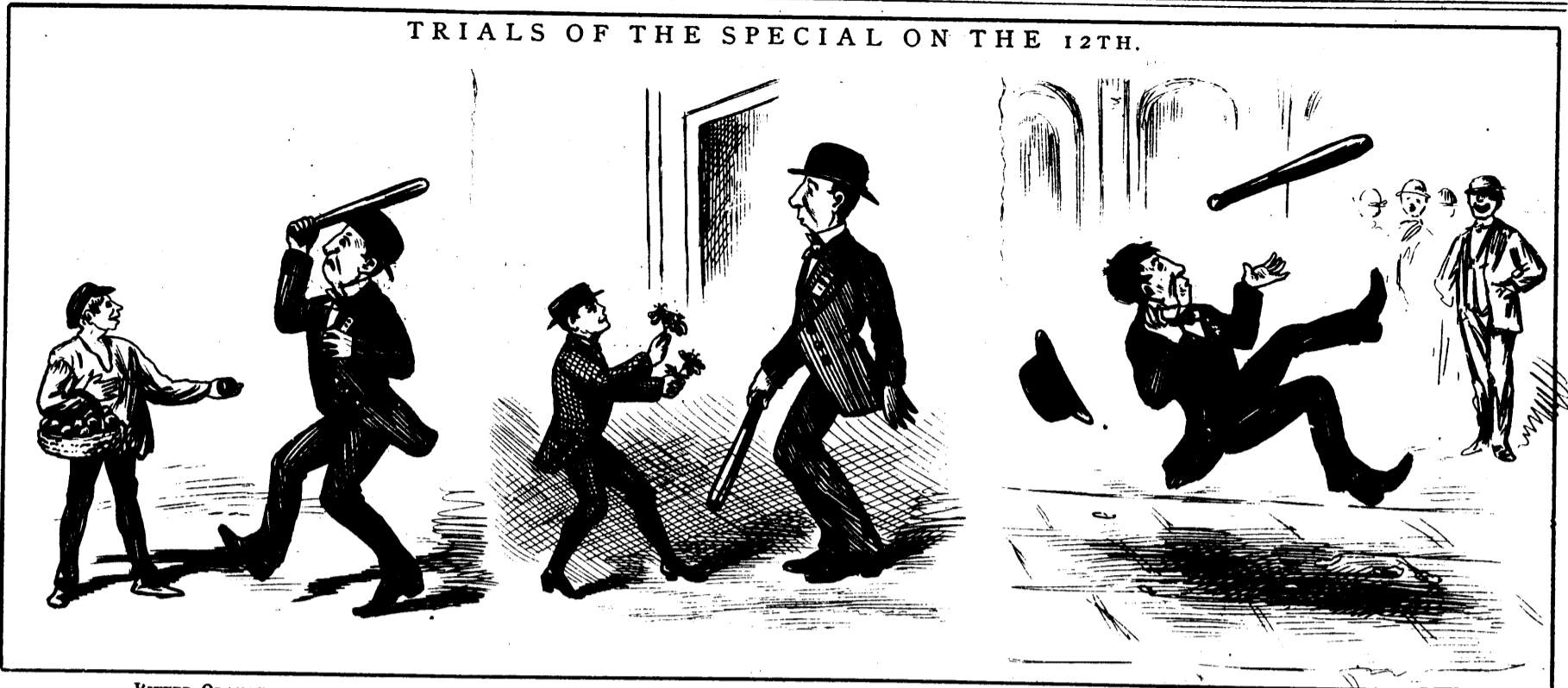
BITTER ORANGES TO BUY.