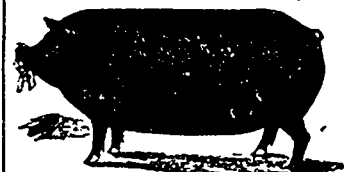
(None Genuine without this Trade Mark)

Get the Best Respected and General Store Keepers.