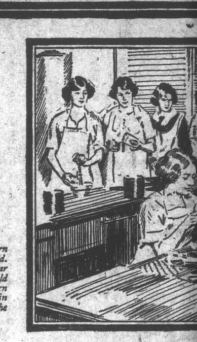
Domestic Science class at Lynchburg College makes spoon bread with Libby's Milk

1 pt. Libby's Milk 1 cup sifted corn meal 1 teaspoon salt 1 teaspoon baking soda 3 eggs pinch of sugar