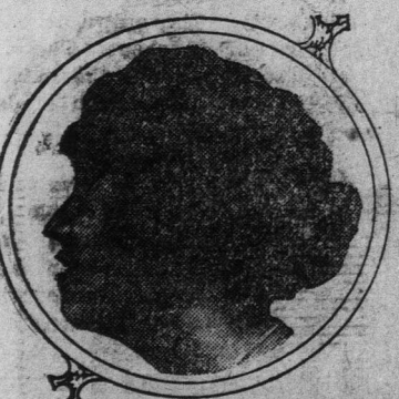
PUTTING THE TRESSES IN GOOD CONDITION.

There is a season of the year when the hair begins to fall out in the most incomprehensible way. Combfuls of one's cherished tresses leave the head at every doing up of the hair in the morning, and the love locks about the forehead and temples that should fluff out becomingly under the hot brim, have a distressing way of falling in limp wisps an hour or two after being carefully waved.