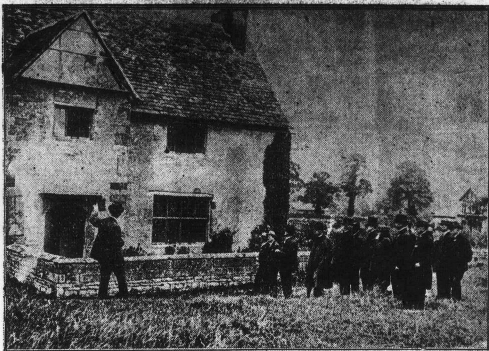
The ten bishops who came to England to attend the Lambeth Conference visiting the ancestral home of George Washington at Sulgrave Manor, North Hants.