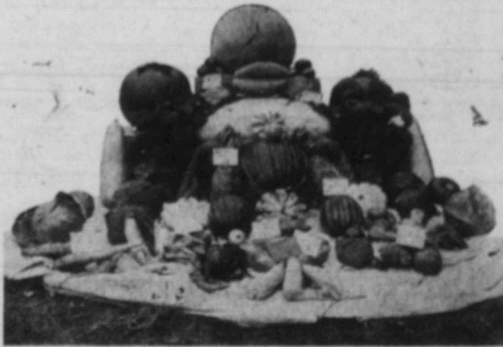
Vegetables Grown Near Winnipeg.

The Prices quoted are for Poultry in good Marketable Condition and are F.O.B. Winnipeg. We are Preparing Crates to any part of Manitoba and Saskatchewan. We are handling all kinds of Dressed Poultry up to Christmas at Highest Market Price. Canada Food Board License No. 7-397. Siskind-Fannenbaum Grocery Co. 465 Pritchard Avenue, Winnipeg, Man.