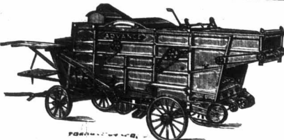
THE TORONTO ADVANCE.

THE TORONTO ADVANCE is the most perfect Thrashing Machine made.