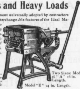
Two Sizes: Model "A" 16 in. Length.

Ideal Concrete Block Machine has been almost universally adopted by contractors and builders throughout the world. The interchangeable features of the Ideal Machines make it possible to rapidly and economically produce concrete blocks for every building purpose, from the most massive construction to daintily beautiful styles of architecture. The same machine makes blocks of any length within capacity, any angle, 4, 6, 8, 10 and 12 inch widths, 4, 6 and 8 inch heights, and any desired design of face.