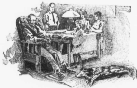
You need recreation but you're too tired—so you stay home

Surely the farmer merits rest and relaxation if any man does. Modern farm work of course has been made lighter by labor saving machinery. The physical toil has been lessened and the farmer given more time to himself. But the need for relaxation and pleasure remains. And it is a real need too . The mental and physical welfare and growth of a man demand variety in life, an occasional change of surroundings and frequent mingling with his fellowmen.