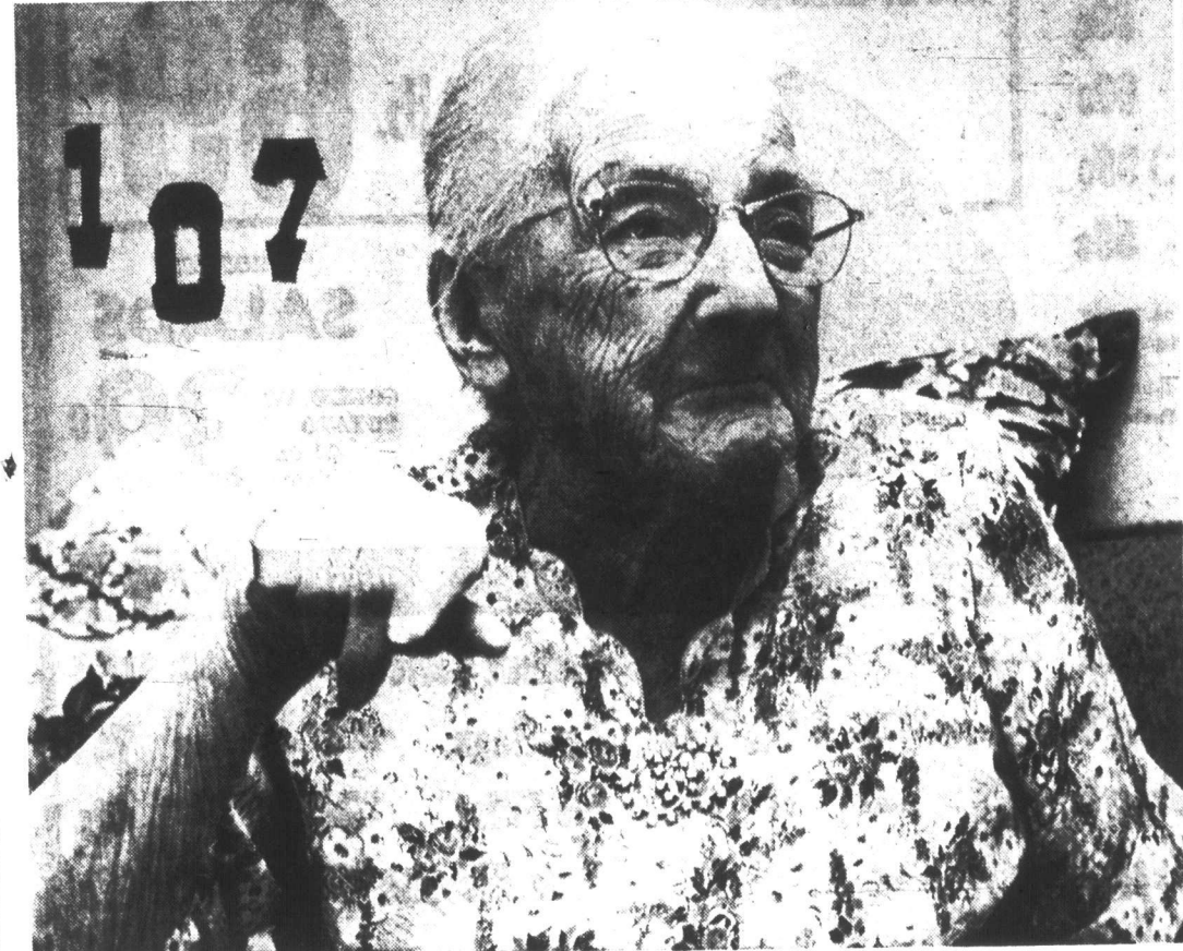
GRAND OLD LADY