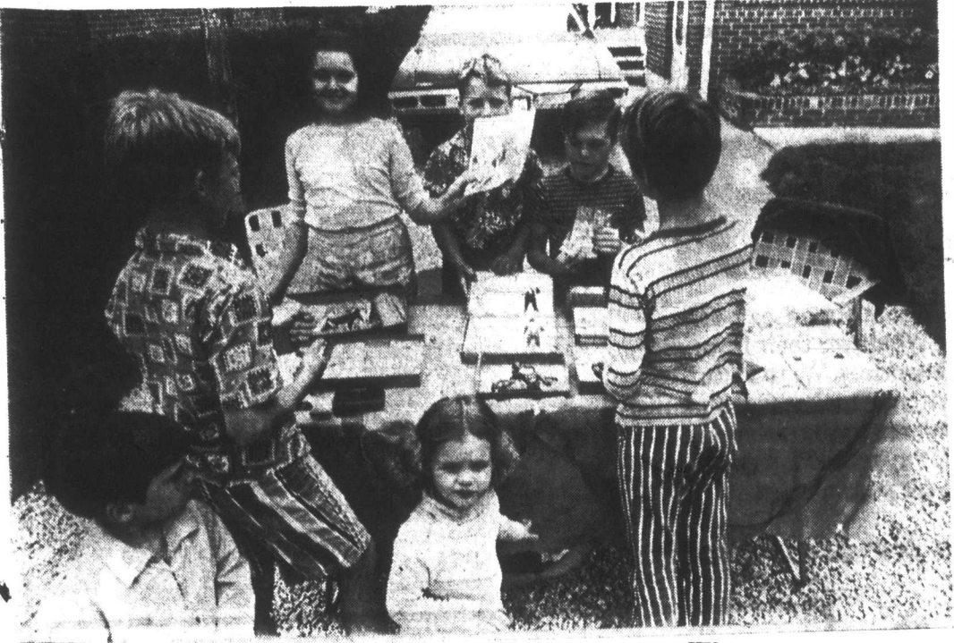
KID'S BAZAAR FOR MUSCULAR DYSTROPHY