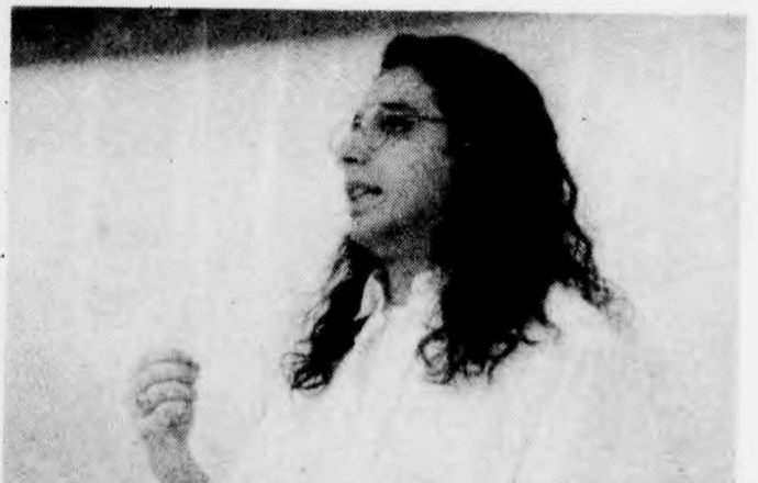
no other options. Ghomeshi is asking that York withdraw its support from the proposal.

The recovery plan would have students pay one third of the $410 million boost, with the provincial government paying the difference.