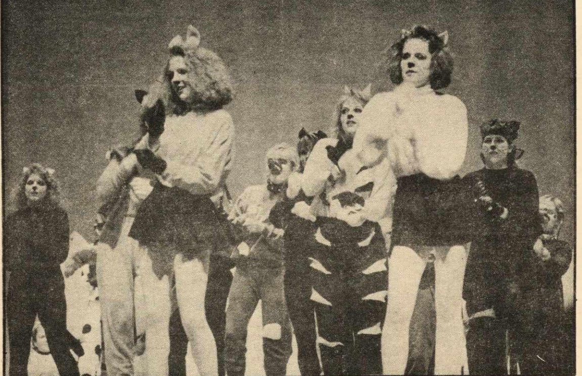
The Nursing cat-astrophes strut their stuff