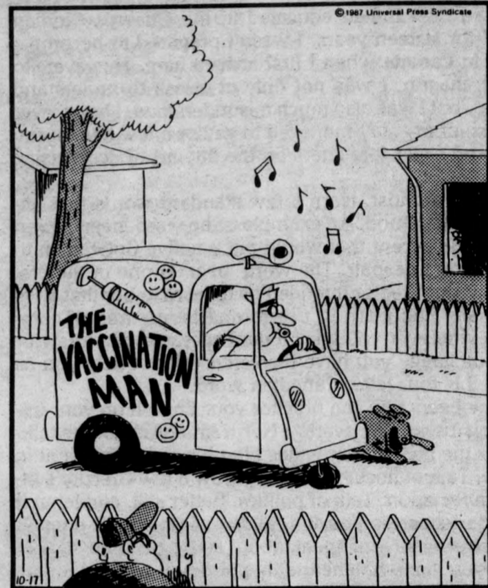
Slowly he would cruise the neighborhood, waiting for that occasional careless child who confused him with another vendor.